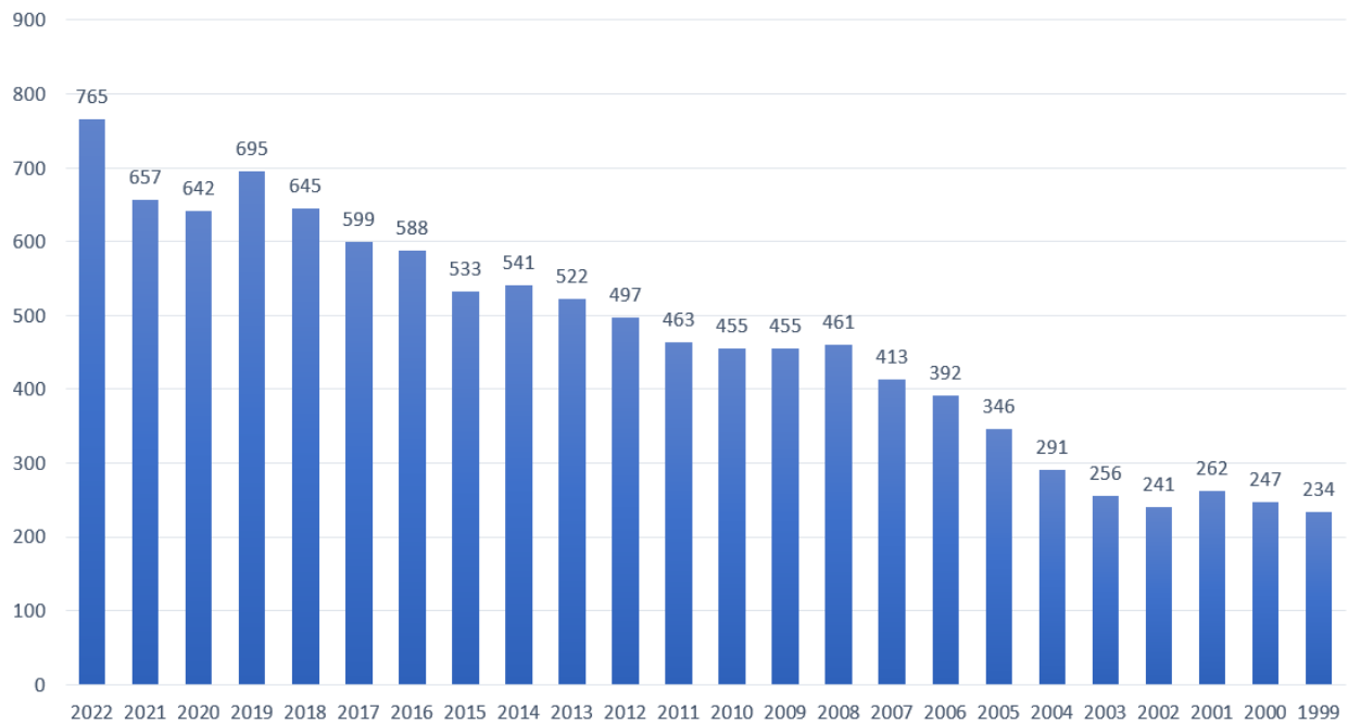
PMI Nova Scotia Year End Membership #s

Membership numbers took a big step this year coming out of a downturn following unforeseen circumstances due to the COVID pandemic. Membership numbers are continuing to rise and currently sit at 789 members as of April 30. We started the year with 765 members.